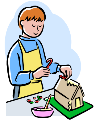
Create your own masterpiece for the Downtown Alliance's "Gingerbread Home Show!"